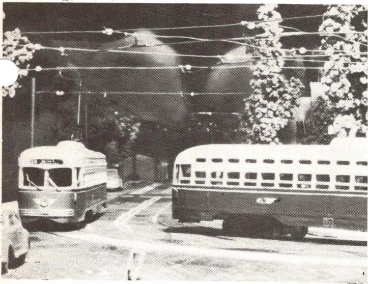
PCCs meet at curve on HO module